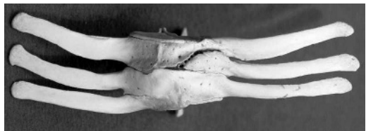
FIGURE 3. Ventral view of fused 11th, 12th, and 13th lumbar vertebrae of striped dolphin ( Stenella coeruleoalba ) from the Adriatic Sea. Old pathologic changes (osteolysis, fusion of vertebral bodies and deviation of vertebral canal) that might be because of previous localized osteomyelitis caused by C. tertium strain Zagreb are clearly visible. Bar=5 cm.

conditions. A Gram's-stained smear of granules from specimens both revealed large gram-positive rods with large, oval, terminally placed spores. After 24 hr incubation under aerobic and anaerobic conditions, a pure culture of opaque, medium-size colonies were recovered. Although cultures of C. tertium often present as gram-negative, especially when cultured under aerobic conditions (Lew et al., 1990), both the aerobic and anaerobic cultures from this striped dolphin were clearly identified as gram-positive non-sporulating rods. Identification of colonies was carried out according to procedure described by Quinn et al. (1994), and using API20 A (bio-Mérieux, Marcy-l'Etoile, France), the isolate was identified as C. tertium with a probability of 99.9%.